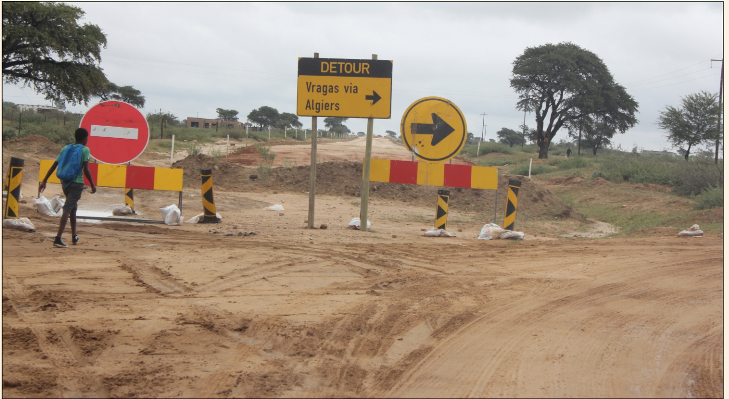
Upgrading of 57km road from Ganyesa to Vragas to Madinonyane (D327): Progress is currently at 25 percent. The resumption of the project was delayed by lengthy negotiations of the new contract terms.