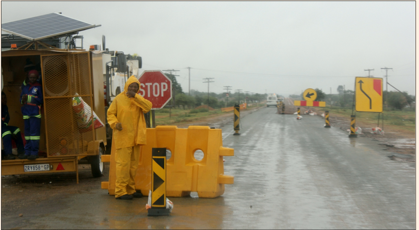
Construction work in progress on the road from Setlopo to Meetmekaar (D413): This project is at 85 percent physical progress. An additional 5km is being considered to link to Springbokpan.