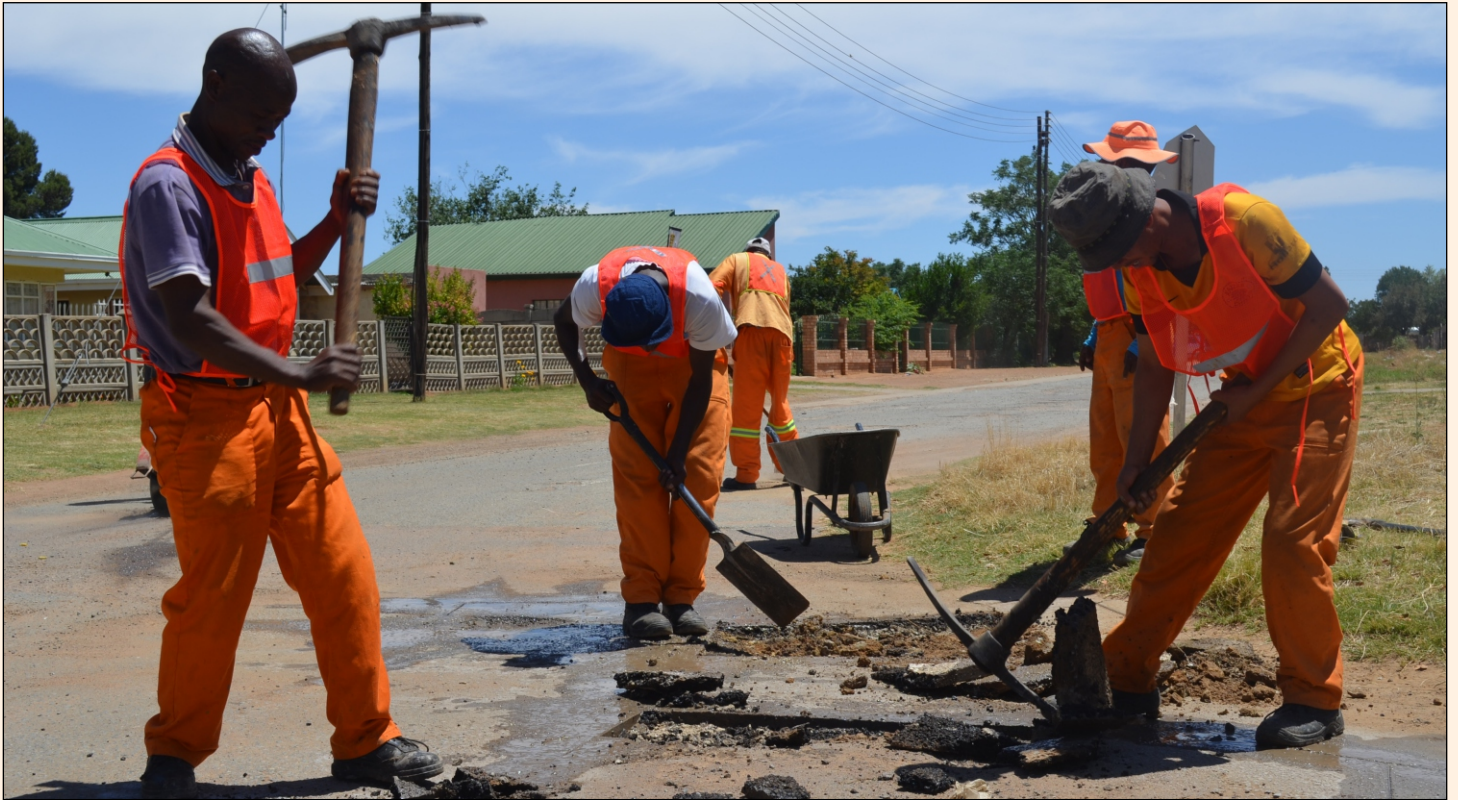
Routine maintenance especially in the form of pothole plugging on roads often pose a challenge but plans are in place to deal with the challenges adequately to make most pothole-infested roads like the one below trafficable