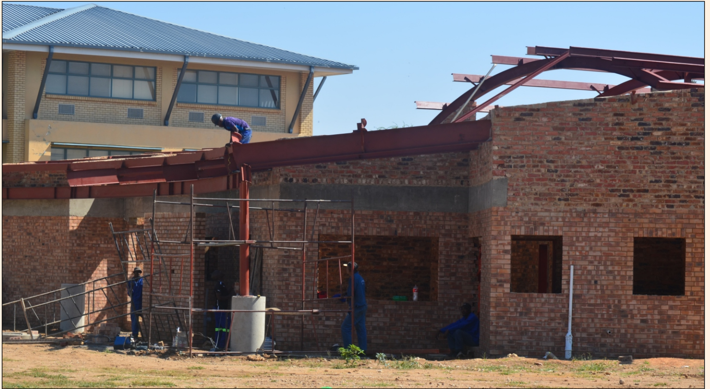
Remarkable progress has been made to the construction of Health and Wellness Centre in the precinct of the department at the cost of R12m. Below: The new Head Office Building is also getting a face-lift of more than R60m.