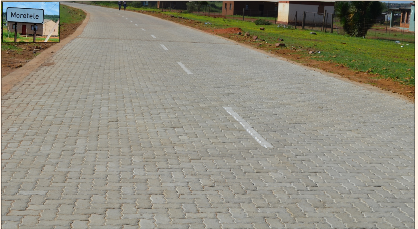
Two of the road projects, 1.8 km each, done as part of the contractor development programme are access roads in Moretele and Khaukhwe villages in Greater Taung Local Municipality. Six emerging contractors benefitted from these projects completing 600m each.