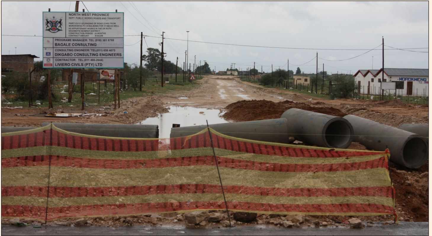
Upgrading of Road D3492 from Morokweng to Bonabona: This project is at 51% physical progress. It is targeted to be completed in February 2017.