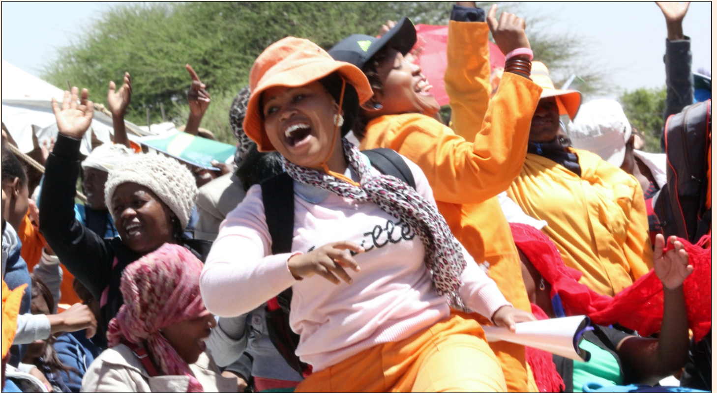
The Department of Public Works and Roads, as mandated, continues to lead, coordinate and monitor the Expanded Public Works Programme (EPWP) as implemented by all public bodies within the Province, inclusive of National Departments with a provincial presence.