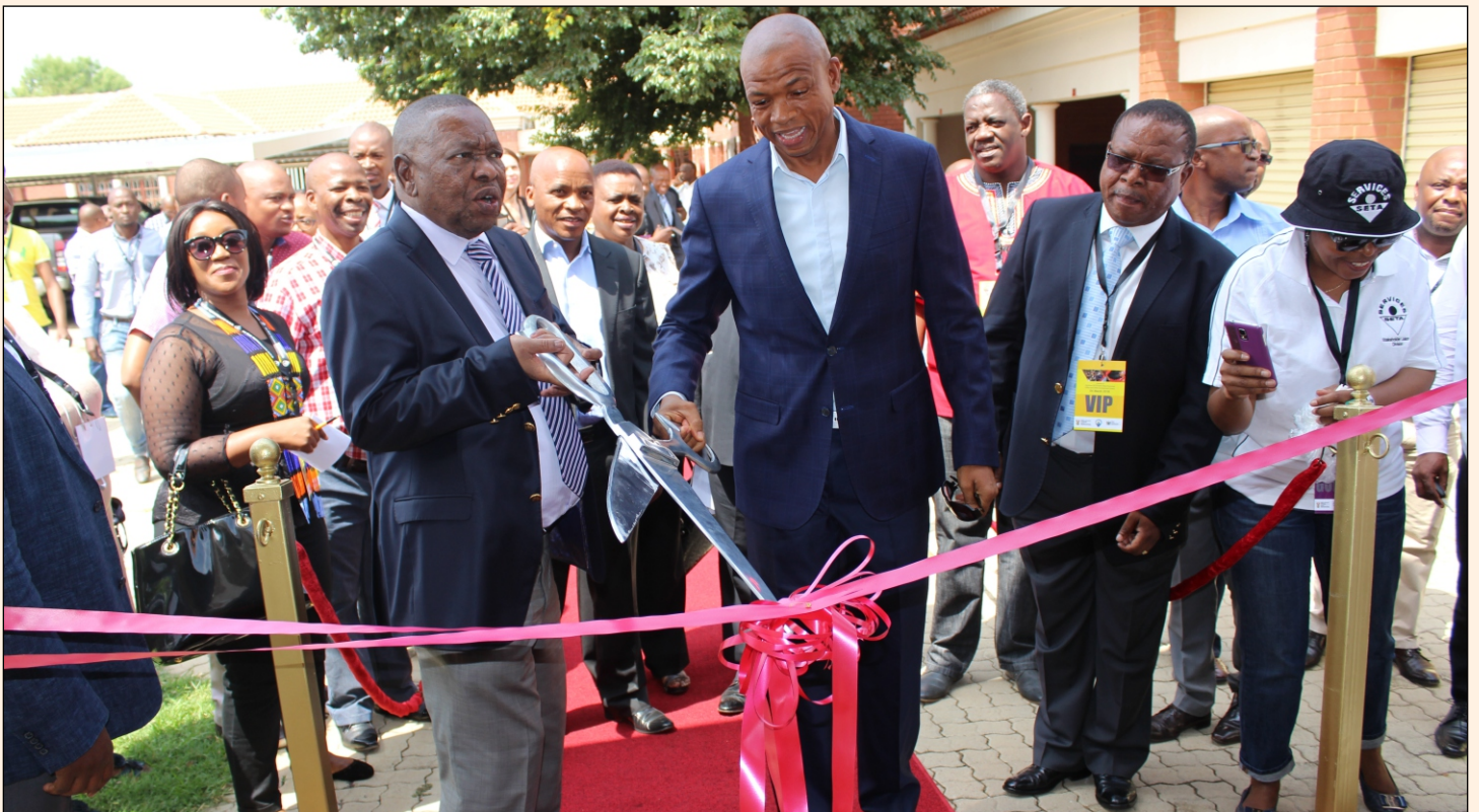
Minister of Higher Education and Training, Dr Blade Nzimande and Premier of Bokone Bophirima, Supra Mahumapelo cutting the ribbon to mark the official opening of first of its kind in the province skills development centre. This centre is in Klerksdorp, Dr Kenneth Kaunda District.