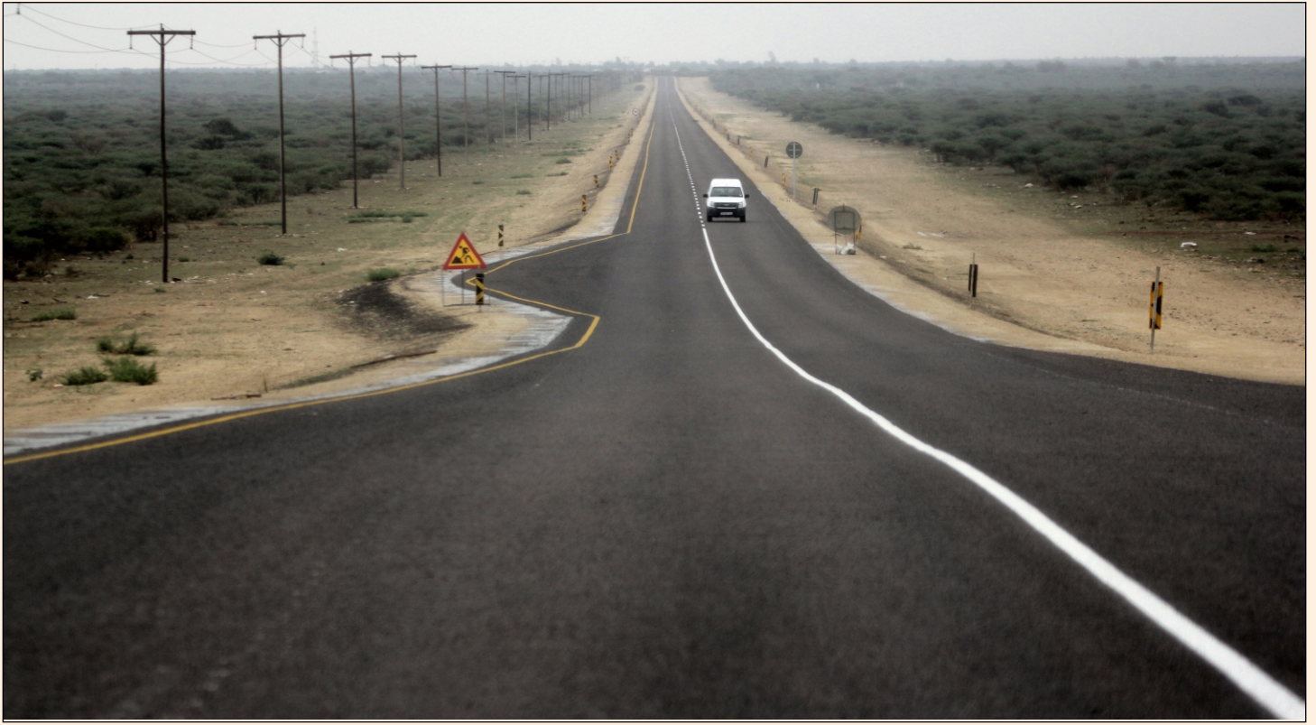
This is a completed road, one of the Capex projects Kagisano Molopo District, Dr Ruth Segomotsi Mompati District. It is from Morokweng to Vostershoop.